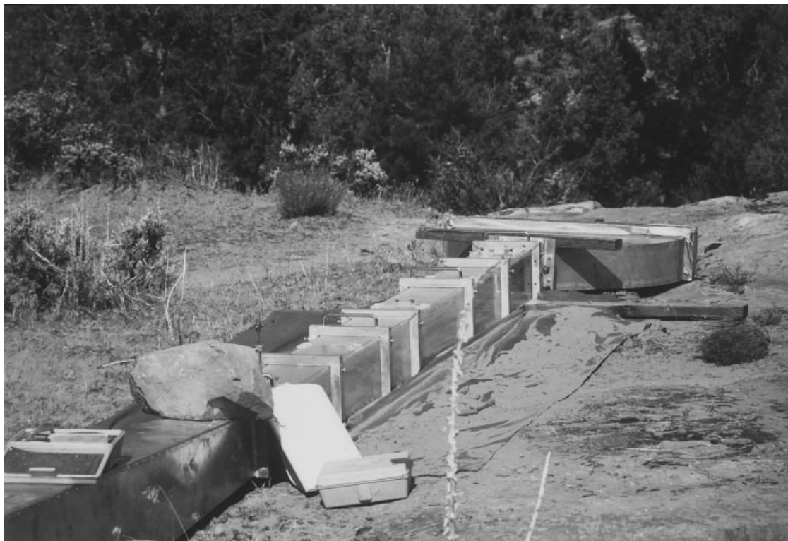
Figure 1. Portable wind tunnel, assembled in the field.

Comparisons across the three crustal classes were done using a two-way ANOVA and multiple range test. T -tests were used to distinguish between disturbance treatments and controls.