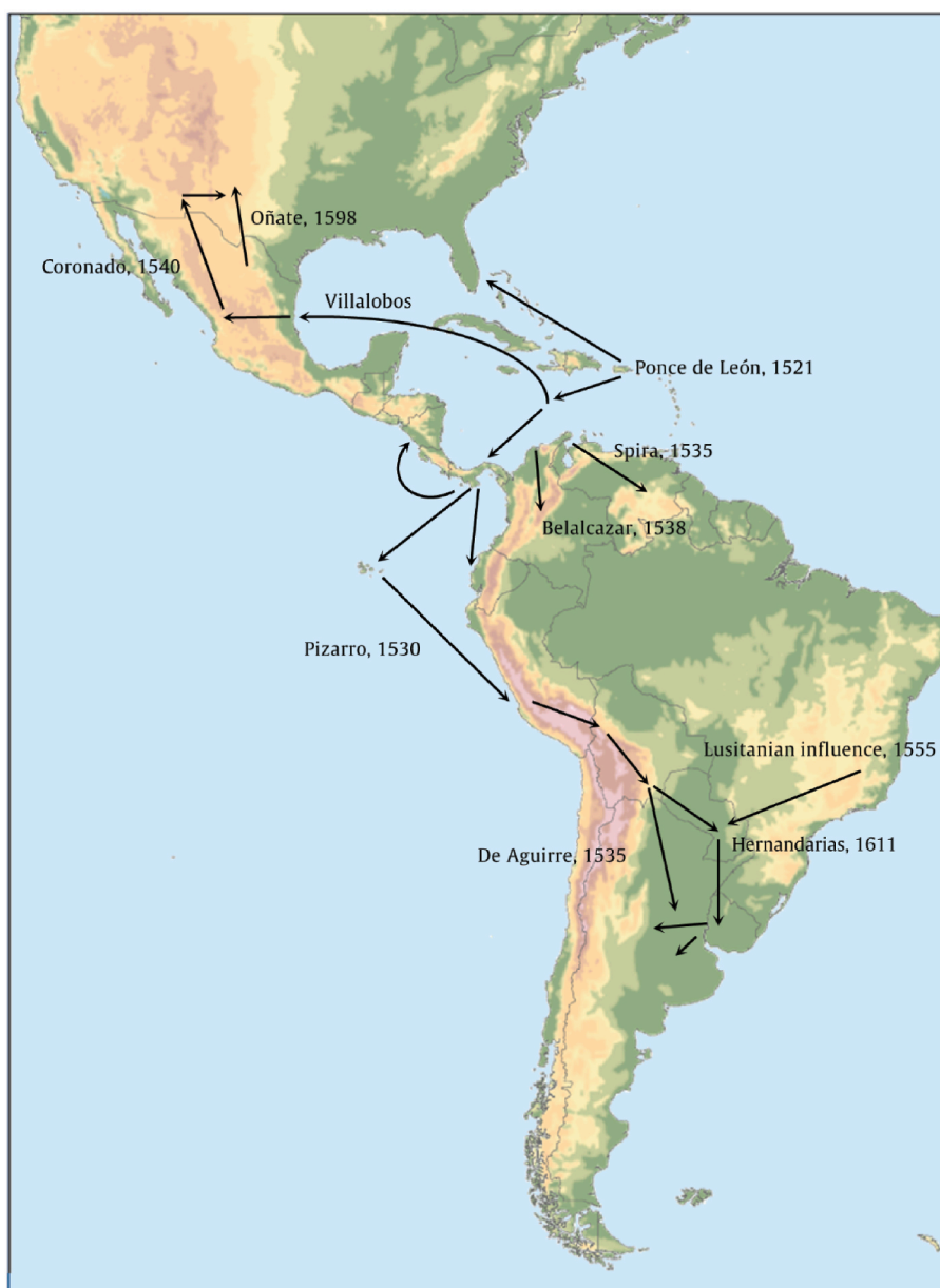
Fig. 1. Map of Criollo cattle introduction into the Americas. Adapted from De Alba Martinez (2011) Fig. 1.2 p. 9.

The geographic conditions, moderate climate, abundance of forage and near absence of predators in the central and eastern region of the country (Pampas) led to an expansion of livestock so important that by