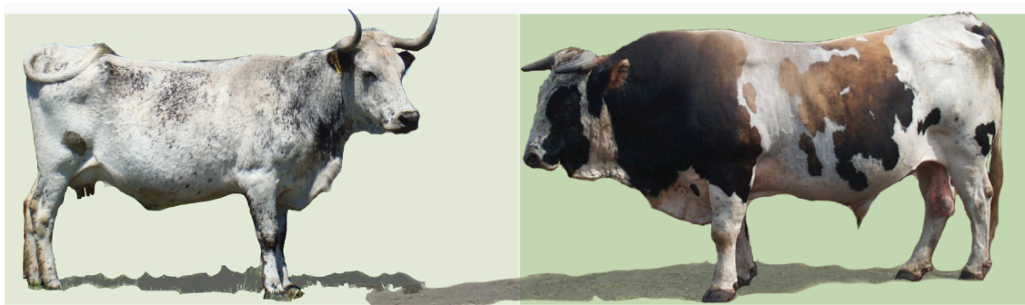
Fig. 2. Argentinian Criollo cow (left) and bull (right) from Palpalá and Cruz de Guerra farms, respectively. Buenos Aires province, Argentina.

Cattle first arrived in México in the 15th century during the Spanish colonization of the Americas through the region that today encompasses