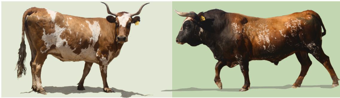
Fig. 5. Raramuri Criollo cow (left) and bull (right) from USDA-ARS Jornada Experimental Range herd in Las Cruces, NM, USA.