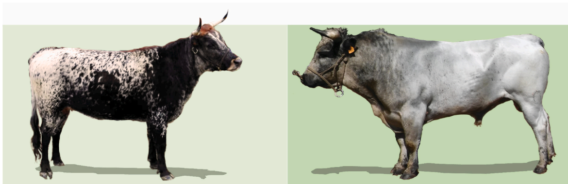
Fig. 4. Uruguayan Criollo cow (left) and bull (right) from San Miguel National Park, Rocha, Uruguay.

Recently, research was conducted to evaluate UCC beef production potential (Armstrong et al., 2021). In comparison with Hereford steers raised in the same conditions, purebred Criollo steers attained almost the same slaughter weight at a similar age, suffered less weight loss during the winter season, and had larger rib eye areas ( P = 0.014 ) and subcutaneous fat depth ( p = 0.045 ). Although Criollo steers weighed less at slaughter, no significant differences were detected compared with Hereford steers regarding carcass weight and carcass attributes ( p > 0.050 ). Criollo steers yielded higher muscle percentage ( p = 0.002 ), lower intermuscular fat percentage ( p = 0.049 ) and lower bone percentage ( p = 0.023 ) than Hereford. Regarding meat quality, no significant differences were detected between breeds regarding shear force, color, or cooking loss measurements ( p > 0.05 ), and Criollo steers tended to have more intramuscular fat ( p = 0.058 ). A sensory panel trial revealed no differences between breeds in tenderness, flavor or general acceptance of cooked meat ( p > 0.05 ). In conclusion, our research