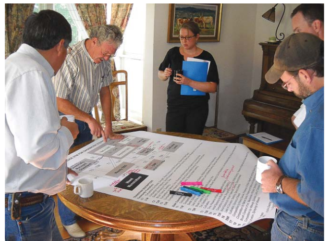
Figure 1. A group evaluating a state-and-transition model at a workshop.

Focus groups are small groups of 6–15 people who are invited to have an informal, semistructured conversation about a subject of interest. It is best to hold separate focus groups for different types of participants with similar backgrounds (e.g., ranchers, conservationists) so that the participants feel free to share information and opinions. Focus groups are an efficient way to gather a lot of information from a relatively large number of people in a short amount of time. Similar to an interview, the focus group discussion is guided by a list of open-ended questions. The group setting allows people to answer each question from their personal perspective, but also respond to and interact with the other participants. As in a workshop, the interactive aspect of focus groups can lead to insights that would not emerge otherwise. Focus groups could be used to develop a draft model, brainstorm an inventory of states, transitions, time scales, and indicators, or provide feedback on an existing model (Fig. 1). They are one of the most rapid of elicitation techniques, but take longer to prepare for than asking for feedback or interviewing individuals. A focus group requires a facilitator and another person to take notes. As with an interview, we strongly recommend audio-recording the focus group for accurate and complete documentation.