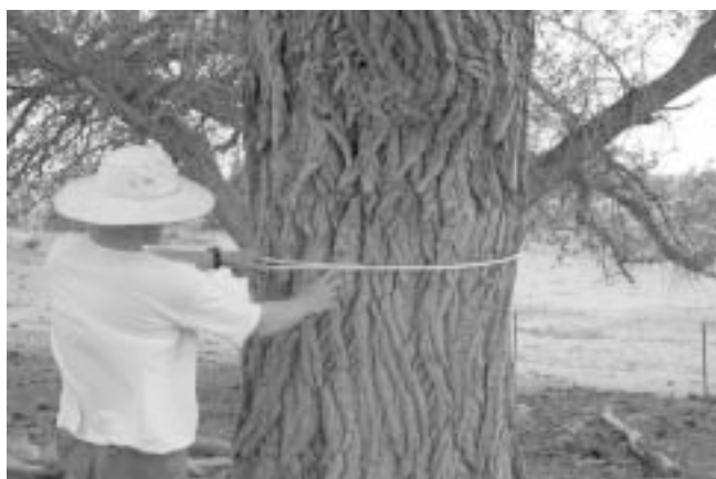
Figure 12.3. Measuring DBH.

For multi-stemmed individuals, \text{DRC for the tree} = \text{SQRT}(\text{SUM}[\text{DRC}^2]).