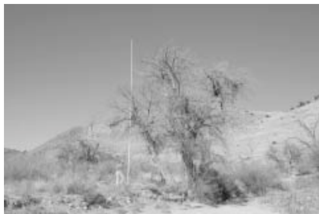
Figure 12.5. Measuring tree height with an extendable range pole.