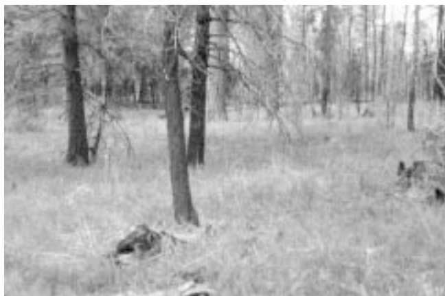
Figure 12.2. Savanna/woodland ecosystem showing relatively low tree density.